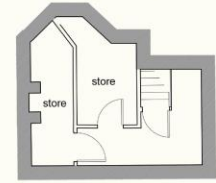
Basement Plan 1:100